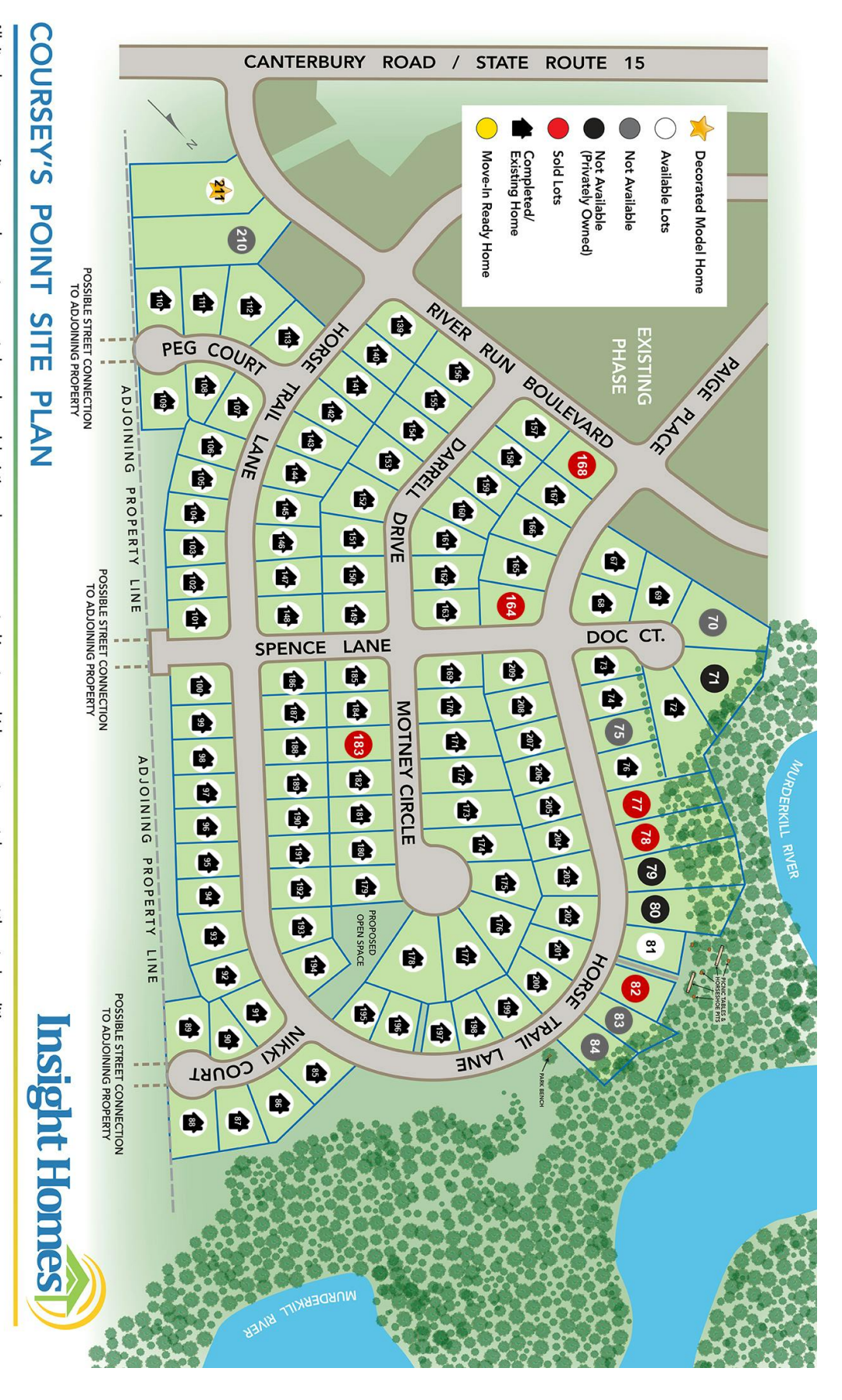
All site plans, community maps and computer generated or enhanced depictions shown are conceptual in nature, which may not accurately represent the actual condition of the item(s) being represented and are subject to change without notice. All buying decisions should be based on visiting and viewing the physical homesite.