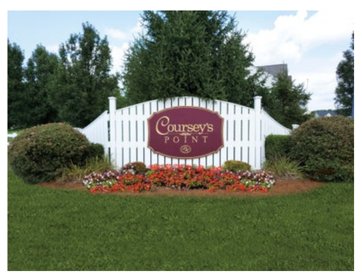
Visit our decorated model at Coursey's Point and learn more about building your new home in Felton.

From Route 1: Take DE-12W/Frederica Road. Turn Right onto DE-12W/Front Street. Follow 0.7 miles. Make a left on Carpenter Bridge Road. Follow for 2.6 miles. Turn Right onto DE-15/Canterbury Road. Drive 0.4 miles to Coursey's Point on your right.