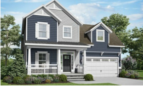
Brenner $446,900 1,975 - 2,489 Sq. Ft. 3 - 4 BR | 2.5 - 3.5 BA | 2 STORY