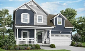
Brenner $447,900 1,975 - 2,489 Sq. Ft. 3 - 4 BR | 2.5 - 3.5 BA | 2 STORY