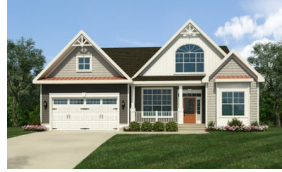
Cartwright $452,900 1,821 - 3,817 Sq. Ft. 3 - 5 BR | 2 - 3.5 BA | 1 or 2 STORY