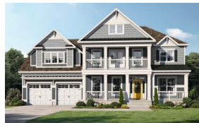
Kramer $605,900 3,167 - 4,277 Sq. Ft. 3 - 6 BR | 2.5 - 4 BA | 2 STORY