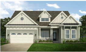
Whatley $471,900 1,979 - 3,590 Sq. Ft. 3 - 6 BR | 2 - 4 BA | 1 or 2 STORY