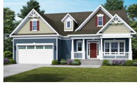
Lloyd $442,900 1,712 - 2,760 Sq. Ft. 3 - 5 BR | 2 - 3 BA | 1 or 2 STORY