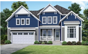
Peterman II $561,900 3,145 - 3,735 Sq. Ft. 4 - 6 BR | 3 - 4 BA | 2 STORY