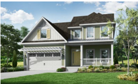
Frank $506,900 2,572 - 3,010 Sq. Ft. 4 - 5 BR | 3 BA | 2 STORY