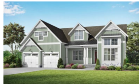
Nelson $511,900 2,405 - 3,941 Sq. Ft. 3 - 5 BR | 2 - 3.5 BA | 1 or 2 STORY