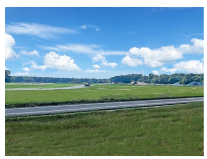
From Route 1: Take Barratts Chapel Rd (Rt 317) West for 1 mile, the community is on the left.

Rural Living Just Minutes from the Hustle and Bustle of Route 1!