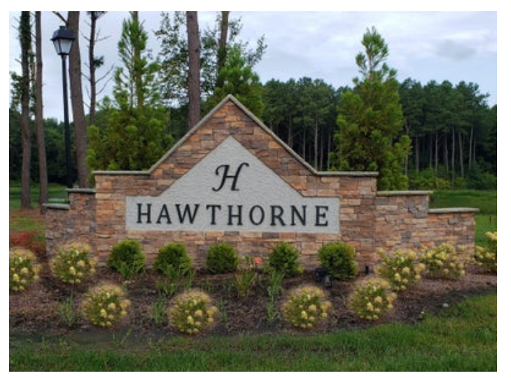
Come visit our decorated model home and experience what itâ \in^{M} s like to live in Hawthorne!

(24794 Lewes Georgetown Highway Georgetown, DE 19947)