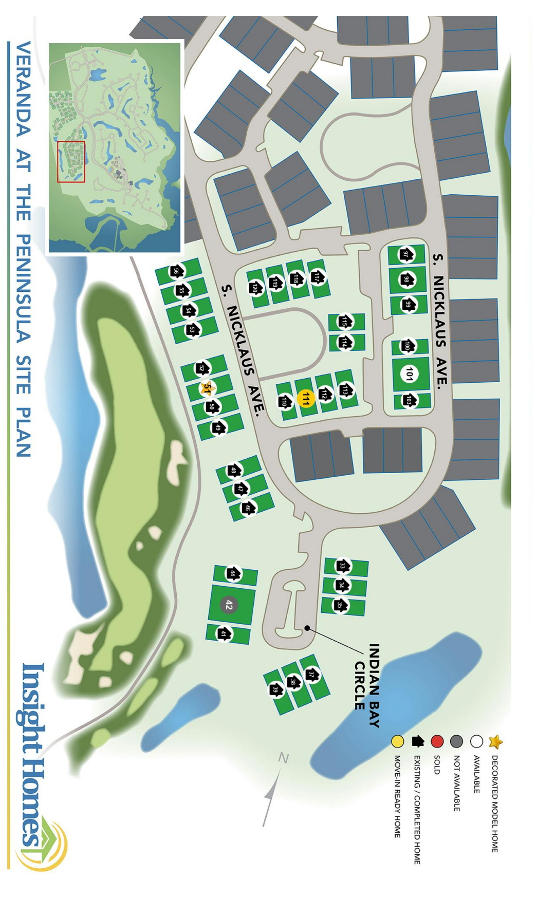
All site plans, community maps and computer generated or enhanced depictions shown are conceptual in nature, which may not accurately represent the actual condition of the item(s) being represented and are subject to change without notice. All buying decisions should be based on visiting and viewing the physical homesite.