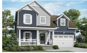
Brenner $442,900 1,975 - 2,489 Sq. Ft. 3 - 4 BR | 2.5 - 3.5 BA | 2 STORY