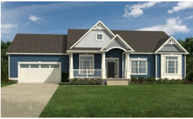
Elaine $445,900 2,181 - 2,603 Sq. Ft. 3 - 4 BR | 2 - 2.5 BA | 1 STORY