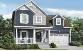
Brenner $360,900 1,975 - 2,489 Sq. Ft. 3 - 4 BR | 2.5 - 3.5 BA | 2 STORY