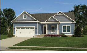
Abbott $299,900 1,284 - 1,722 Sq. Ft. 3 BR | 2 BA | 1 STORY

Build On Your Lot, Sussex & (portions of) Kent County, DE 19958