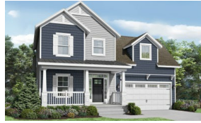
Brenner $360,900 1,975 - 2,489 Sq. Ft. 3 - 4 BR | 2.5 - 3.5 BA | 2 STORY