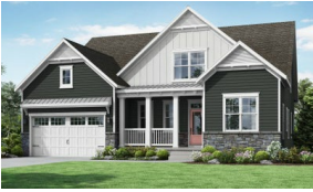
Cartwright $354,900 1,821 - 3,817 Sq. Ft. 3 - 5 BR | 2 - 3.5 BA | 1 or 2 STORY