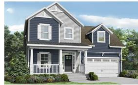
Brenner $388,300 1,975 - 2,489 Sq. Ft. 3 - 4 BR | 2.5 - 3.5 BA | 2 STORY