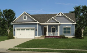
Abbott $308,300 1,284 - 1,722 Sq. Ft. 3 BR | 2 BA | 1 STORY

Build On Your Lot, Select Counties, MD 21801