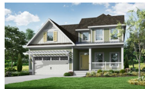
Frank $425,000 2,572 - 3,010 Sq. Ft. 4 - 5 BR | 3 BA | 2 STORY