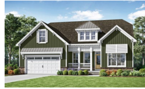
Whatley $367,299 $392,300 1,979 - 3,590 Sq. Ft. 3 - 6 BR | 2 - 4 BA | 1 or 2 STORY