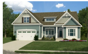
Jerry $403,300 2,140 - 3,401 Sq. Ft. 3 - 6 BR | 2 - 3.5 BA | 1 or 2 STORY