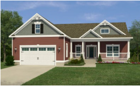
Vandelay $345,400 1,555 - 2,110 Sq. Ft. 3 BR | 2 BA | 1 STORY