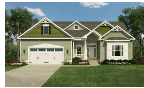
Drake $371,500 1,918 - 2,536 Sq. Ft. 4 BR | 2 BA | 1 STORY