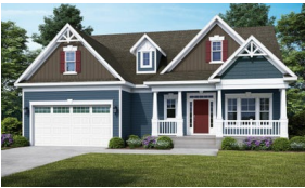
Lloyd $367,300 1,712 - 2,760 Sq. Ft. 3 - 5 BR | 2 - 3 BA | 1 or 2 STORY