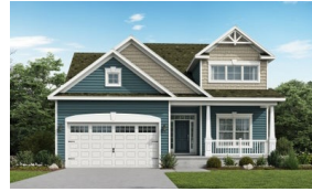
George $340,200 1,514 - 2,920 Sq. Ft. 3 - 4 BR | 2 - 3 BA | 1 or 2 STORY