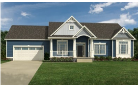
Elaine $391,000 2,181 - 2,603 Sq. Ft. 3 - 4 BR | 2 - 2.5 BA | 1 STORY